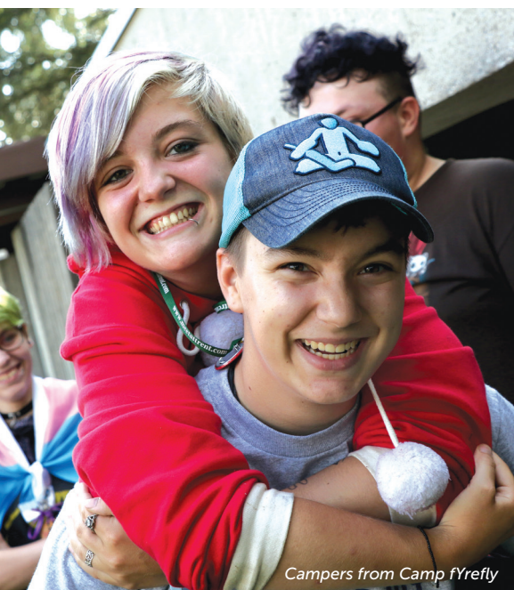
Campers from Camp fYrefly