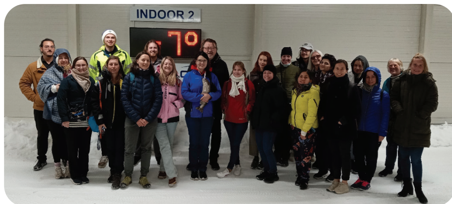
The Calotte Academy 2023 participants at UTAC in Ivalo, Finland. The company tests cars and tires under winter conditions for safety and performance.

government and personal relationships are affected by and help to shape national and regional borders. Two presenters shared their analysis of the dynamic relationships between Czechia and its neighbours. The research highlighted the pressures of the COVID-19 pandemic on cross-border relationships and the way that many countries replaced their images as collaborators and helpful allies to isolationist narratives in which each country was an island fending for itself.