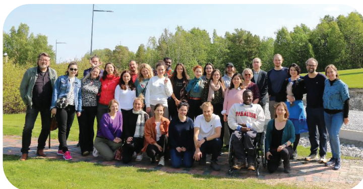
The Calotte Academy 2023 participants with faculty from UiT The Arctic University of Norway in Tromsø, Norway

Team Canada presented on our current graduate research projects, all of which focus on topics relevant to Indigenous Peoples in Canada. Other presenters also explored topics relating to Indigenous Peoples, mostly focusing on Sami experiences. We learned about the controversies surrounding Norway's shift to green energy and how this shift affects Sami territories. We also learned about traditional customs and practices from a reindeer herder. This line of work is