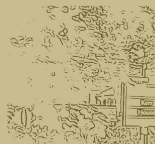
Kerr House: Ca

The highlights are the phenomenal contributions to academics and scholarship work that Frost students have made. We have had some real “wins” in terms of students securing prestigious scholarships over the past few years. We have also seen numerous nominations and awards for [student] teaching support, as well as, recognition of the quality of their theses and dissertations -- not only at Trent, but from the broader academic community.