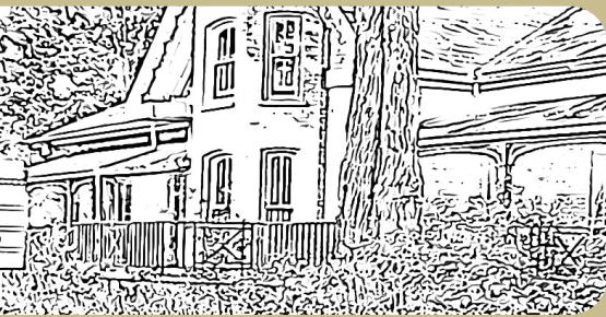
Catherine Parr Traill College campus

for the Study of Canada/ d'études canadiennes established 1982