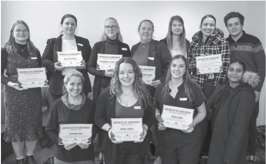
Award Recipients from the 2024 Celebration of Research

Presented to a student (or group of students) who exemplified dedication, creative thinking and problem-solving, and professionalism throughout the completion of their Community-Based Research project, helping to strengthen partnerships within and outside of the University.