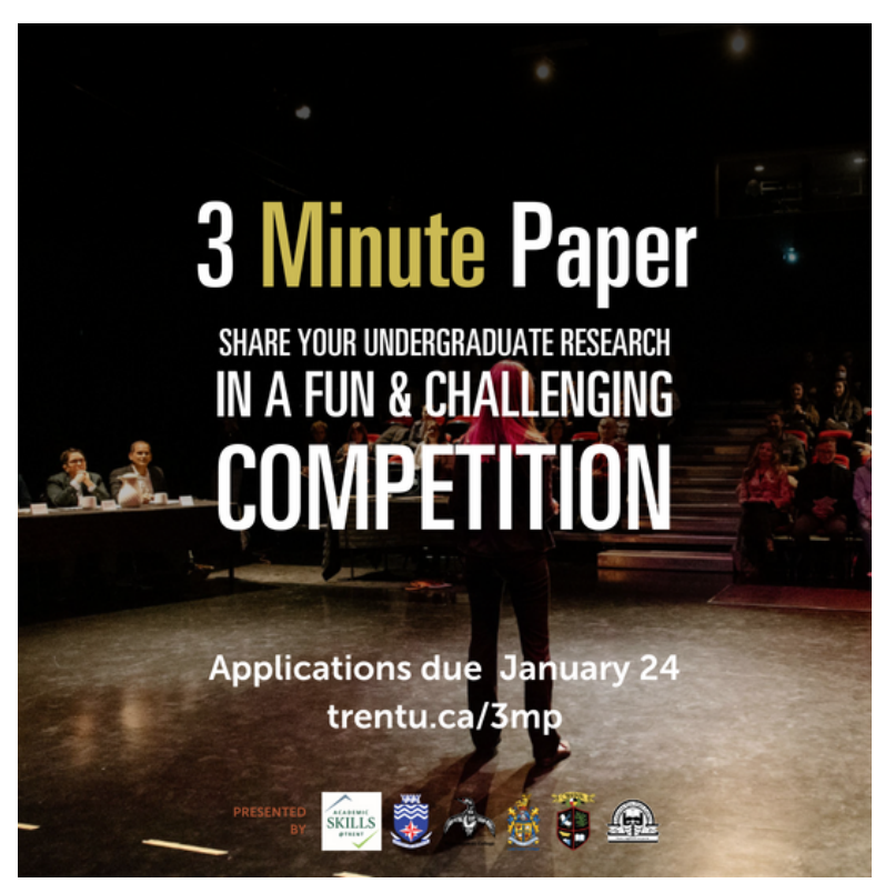
3 Minute Paper (undergraduate) is back! Submit your thesis/group project/research; visit trentu.ca/3mp for more information. #trentu #research

Traill Wishes you happy holidays! To start off the holiday season, on December 6th we will be doling out exam care packages packed with de-stressors, school supplies, toys and support guides, available while supplies last! So come on down for some free exam loot!