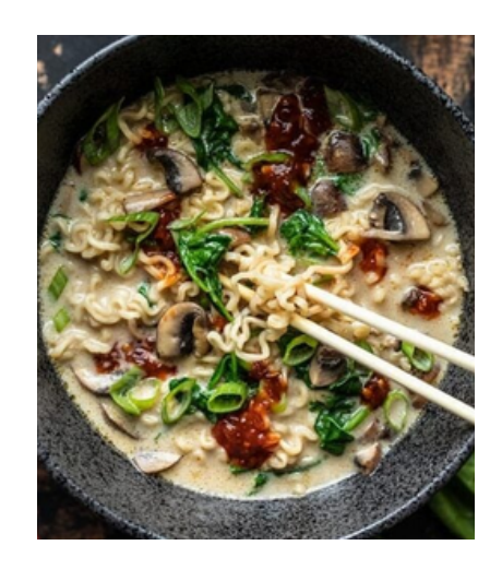
Optional Garnishes 1 green onion, sliced 1 Tbsp chili garlic sauce or sriracha

Turn the heat off, add a heaping handful of fresh spinach, and stir until the spinach is wilted (about 30 seconds). Pour the coconut milk into the pot and stir to combine.