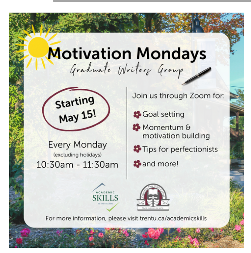
Graduate students join us on Monday mornings to get inspired with your writing. Register for the Zoom link at <a href="https://www.theo.org/">The Student Experience Portal</a>