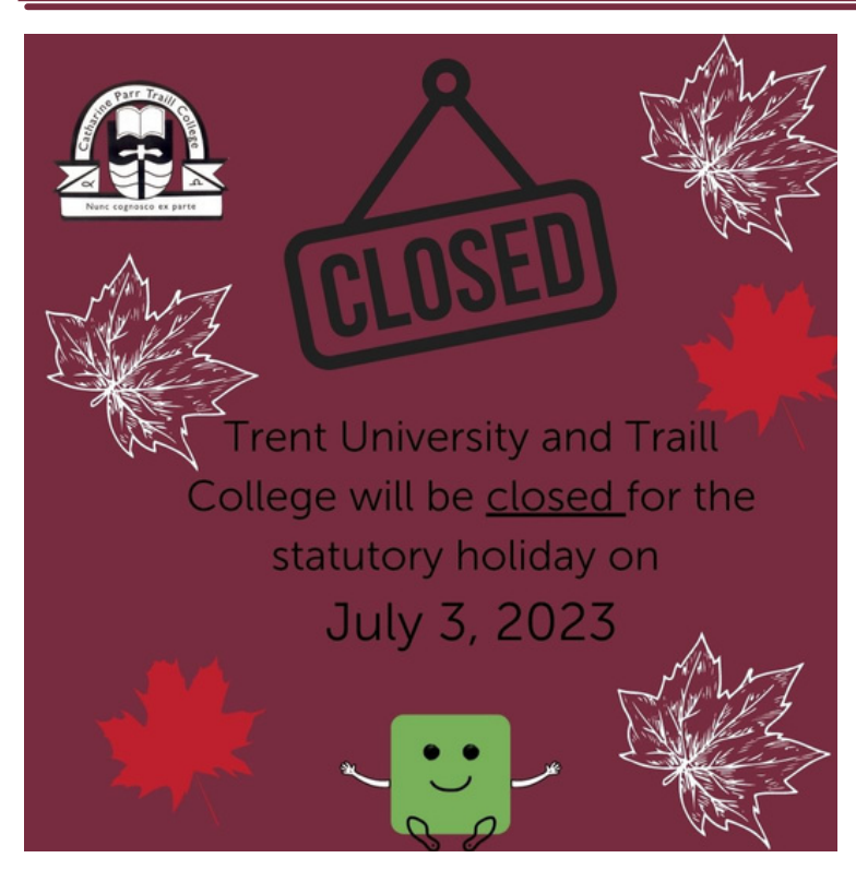
Please note that Trent University and Traill College will be closed July 3, 2023 for the statutory holiday.