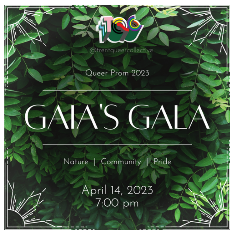
The Trent Queer Collective invites you to a night of nature, community, and all things queer! Join us at Sadleir House on April 14th to enjoy dancing, drag performances, and tasty treats. Tickets on sale starting March 31st at 4pm, here.