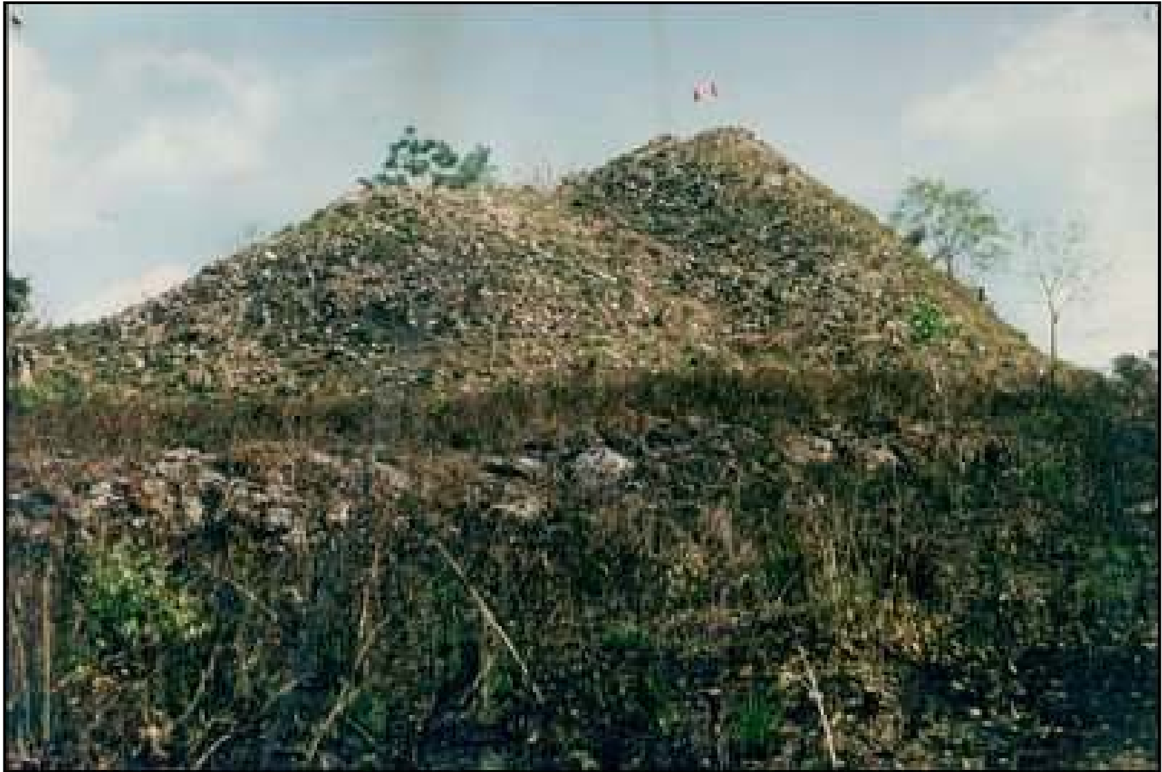
Pacbitun, Belize: View of south side of Structure 1 (16m), on Plaza A, begun during the Terminal Preclassic Period (100 B.C.-A.D. 250) and abandoned in the Terminal Classic Period (A.D. 700-900). (see Healy 1990, "Excavations at Pacbitun, Belize: Preliminary Report on the 1986 and 1987 Investigations," Journal of Field Archaeology 7:247-262).