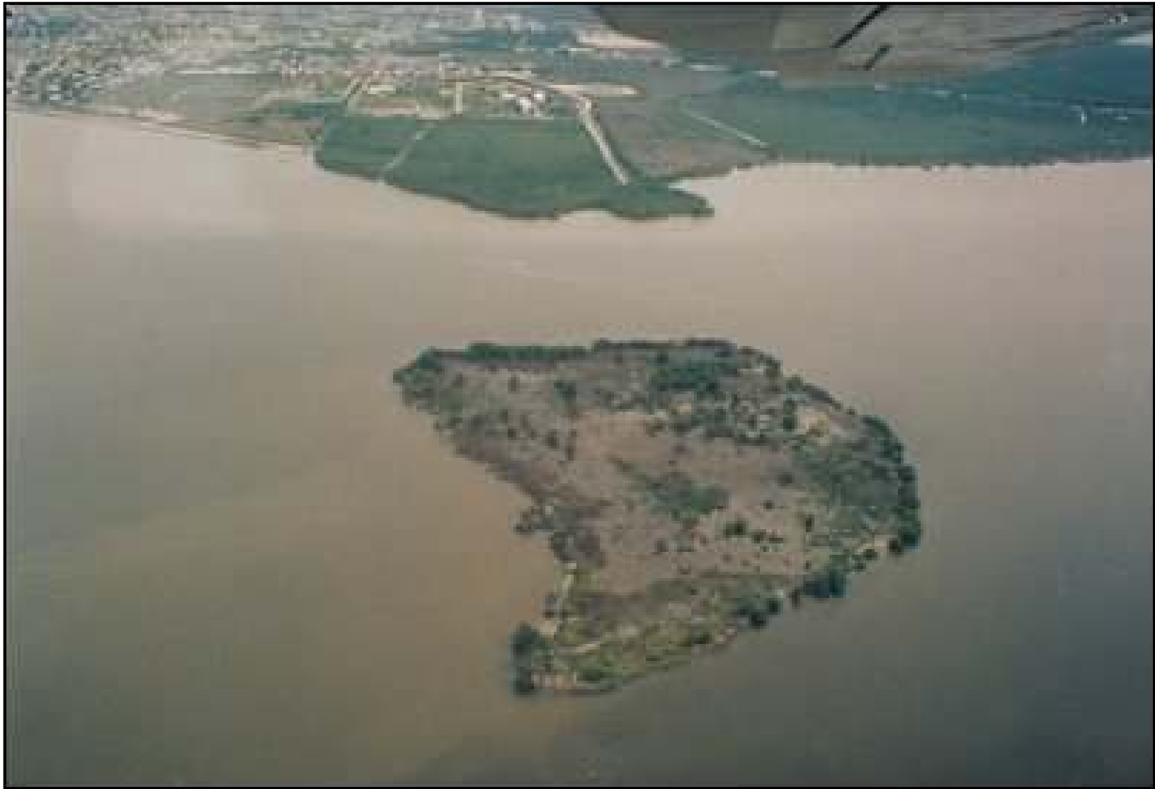
Aerial photograph of Moho Cay, Belize, a Classic Period Maya trade port located near the mouth of the Belize River, outside modern day Belize City (Healy and McKillop 1980, "Moho Cay, Belize: A Preliminary Report on the 1979 Field Season," Belizean Studies 8:10-16; and Healy et al. 1984, "Analysis of Obsidian from Moho Cay, Belize: New Evidence on Ancient Maya Trade Routes," Science 225: 414-417.